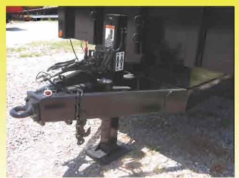
Trailer includes 3" pintle eye, jack stand, quick couplers, and 15,000 lb. capacity draw bar

THE INDUSTRY STANDARD SINCE 1979 EFFICIENT! VERSATILE! AFFORDABLE!