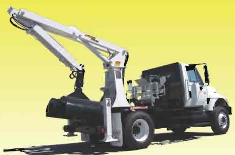
Designed for use with a Petersen model RL-3 Lightning Loader grapple truck