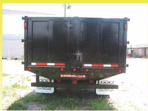
Comes standard with latching barn doors & six 3/4" fabricated plate hinges